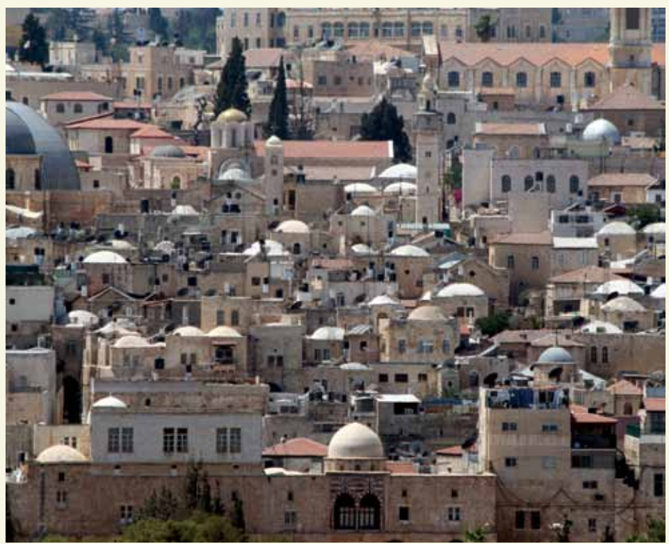
Old City / East Jerusalem, photo by GhtH.

for Palestinian residents of the old city. My husband built the room using cheap materials and not concrete. A month after he finished the room we received a notice from the Jerusalem municipality and a 14,000 shekel fine (nearly $3,500). We were very sad, we cannot afford this amount of money and at the same time there was no choice for us, we needed to expand to have the extra space," says Amani.