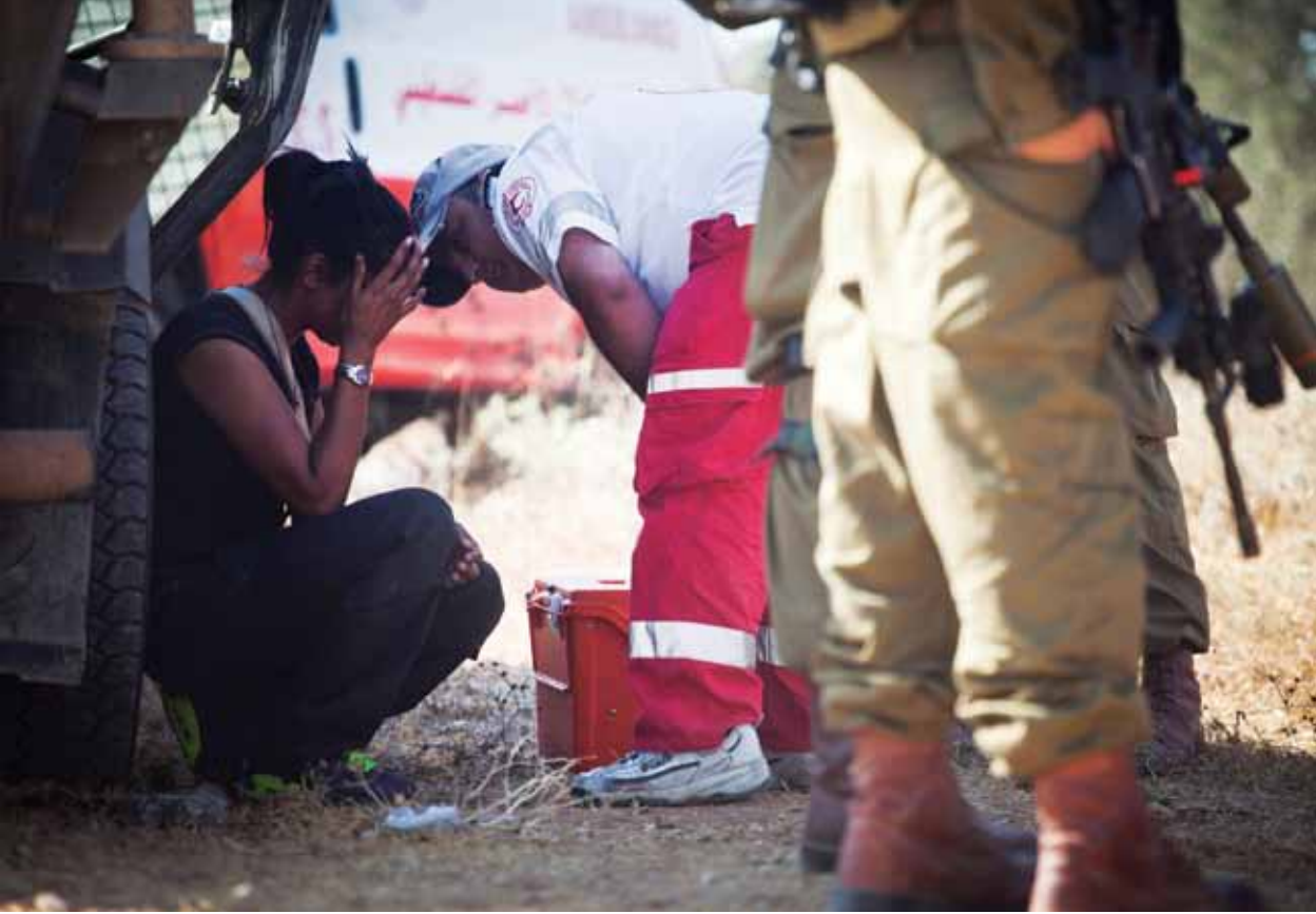
Woman treated in An Nabi Saleh, photo by Oren Ziv/Activestills.

1967 military order that effectively prohibits Palestinian demonstrations and free speech. The order stipulates that a "political" gathering of 10 or more persons requires a permit from the military. The penalty for a breach of the order is 10 years imprisonment or a heavy fine.<sup>6</sup>