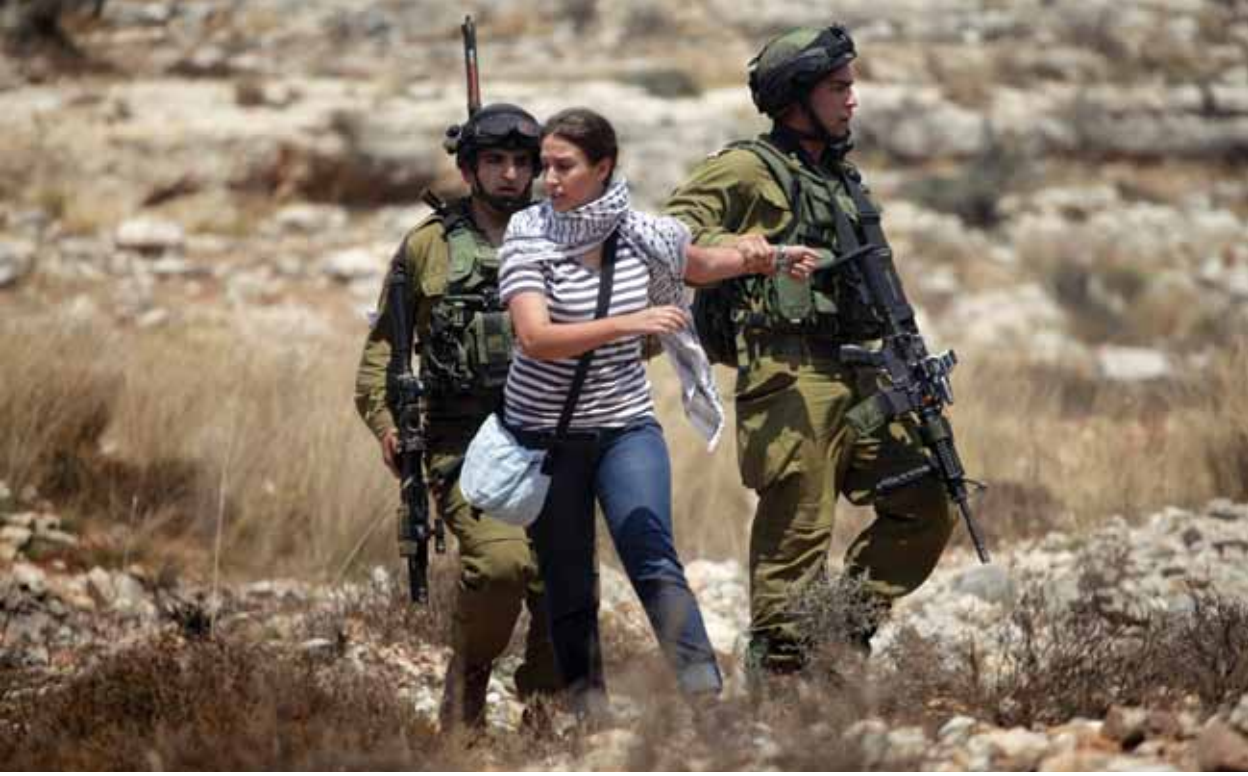
Woman arrested during demonstration in An Nabi Saleh, photo by Anne Paq/Activestills.

According to the UN, in 2011 the number of settler attacks resulting in Palestinian casualties and property damage increased by 32 percent, and by 144 percent since 2009. According to the same source, 10,000 Palestinian-owned trees (mostly olive trees) were damaged or destroyed by Israeli settlers in 2011, undermining the livelihoods of hundreds of families. Also in 2011, 139 Palestinians were displaced due to settler attacks, many forced to leave their homes for good.