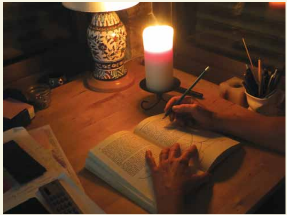
Woman studying by candle light

Arguments and even fights erupt between passengers and taxi drivers over prices. This I find unbearable. I sometimes wonder why I even bother studying, what use is education under these circumstances? I have no hope for the future; the situation is a disaster with no end in sight. I can hardly say I have a life here in Gaza."