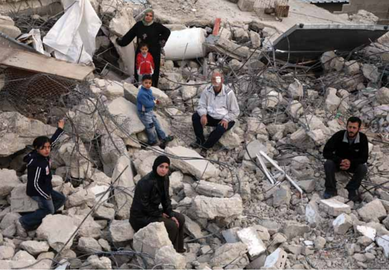
Family sitting on the rubble of their home in Silwan, East Jerusalem

in the area who rely on them to provide water for livestock, crops and domestic water consumption. Between 2009 and July 2011, 44 Palestinian water cisterns were destroyed by the Israeli authorities in Area C for being built without permits. It is important to note that these "administrative demolitions" carried out in accordance with Israeli military regulations, violate international law which prohibits the destruction of property considered essential for the survival of the civilian population.<sup>24</sup> The human cost of these "administrative demolitions" is that since 2009, at least 13,602 Palestinians have been adversely affected resulting in 127 displacements.<sup>25</sup>